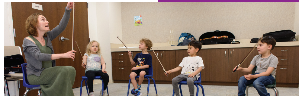
Students discovering the violin bow in Instrument Exploration class.