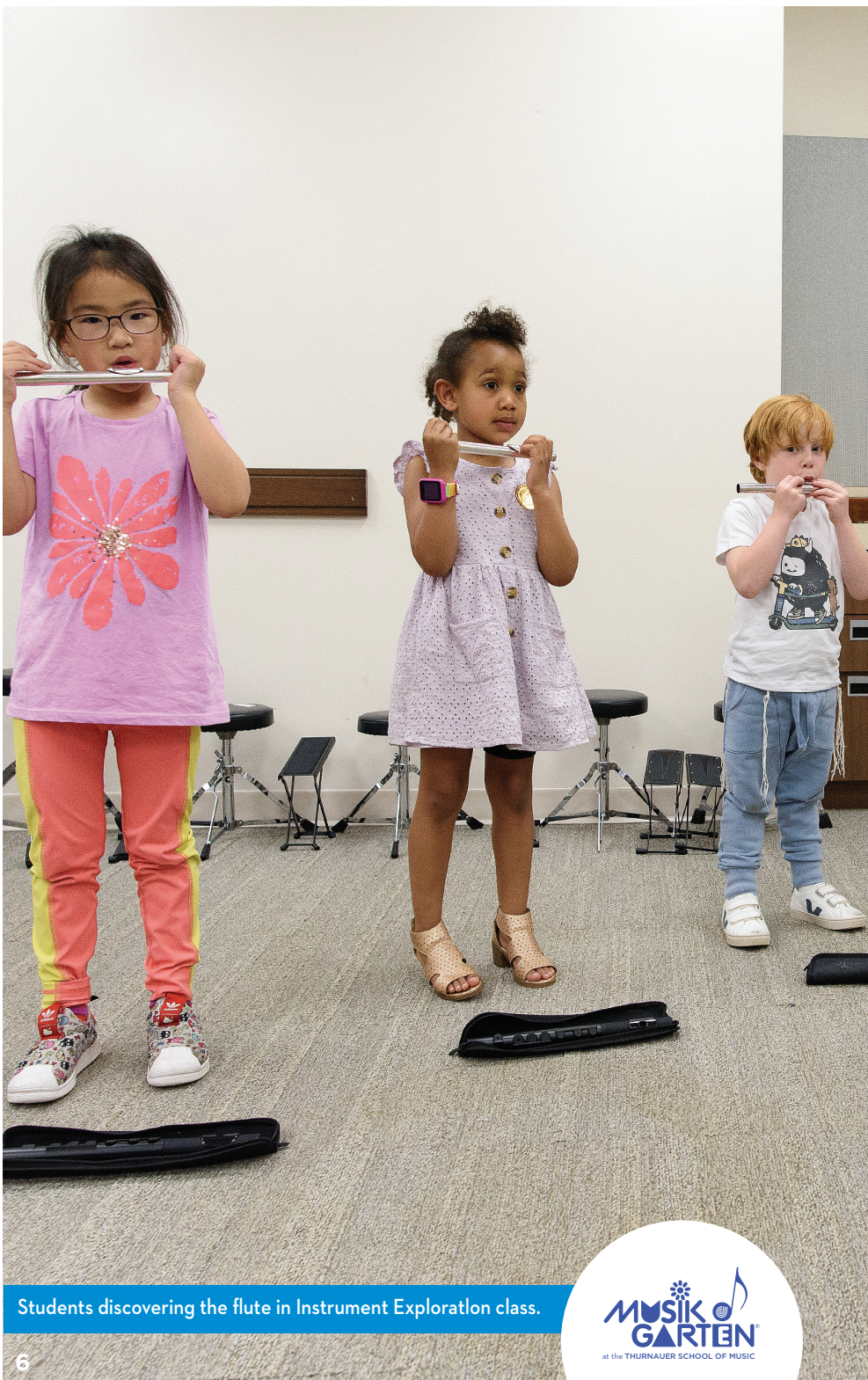
Students discovering the flute in Instrument Exploraton class.